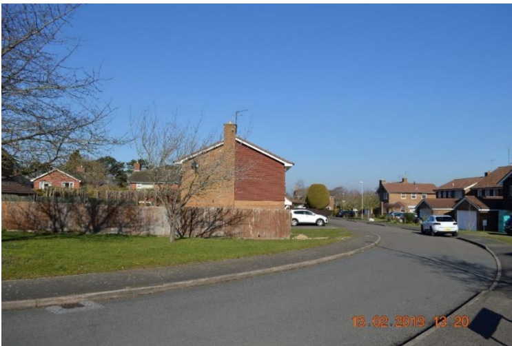
Lime Farm Way.