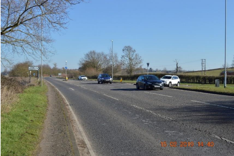
A428 Bedford Road.

Crossing points for pedestrians limited and dangerous, especially since new industrial development. A number of lives have been lost on this section of the road. Speed and volume of traffic make it difficult for foot soldiers.