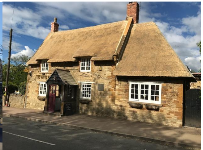
The Old Cherry Tree (1575 a.d.)