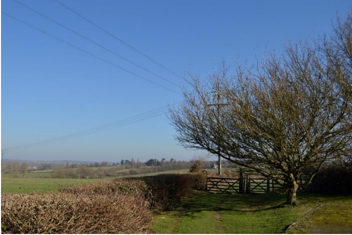
Just one of our many outlooks.