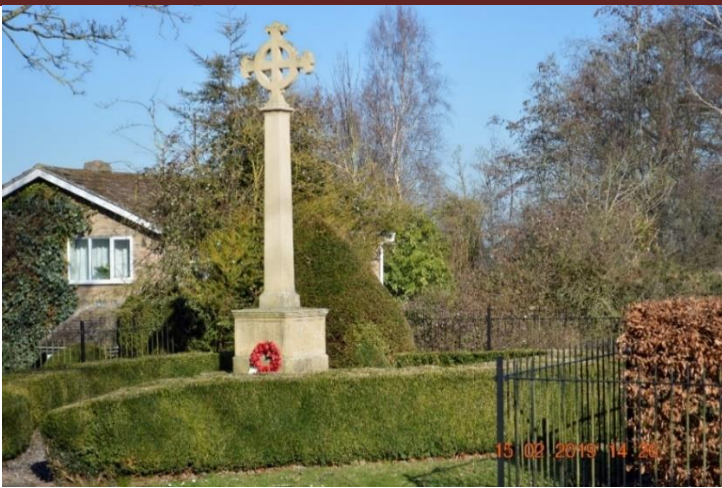
The Cross War Memorial