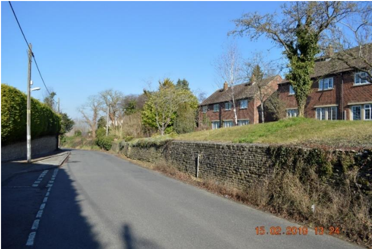
The set back cottages, originally council.

photographs of the village show exactly that. They are in no particular order, deliberately, to indicate new and old and how they mix.