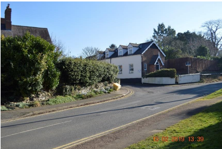
The Old Chapel