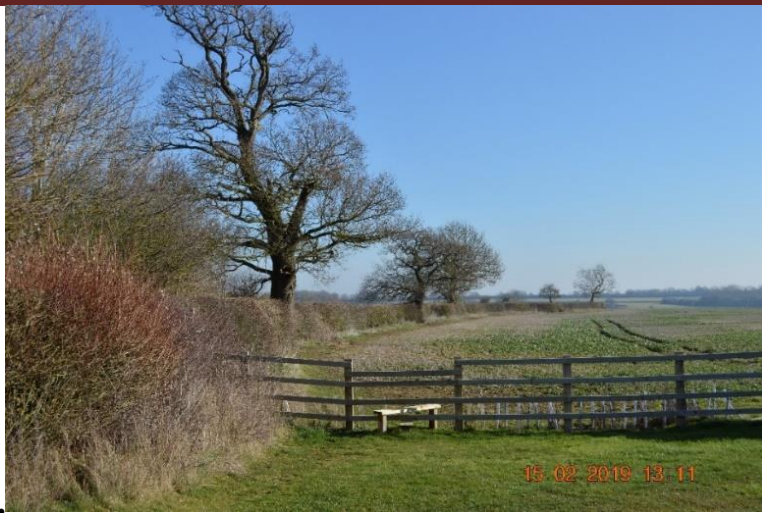
Just one of our many Footpaths