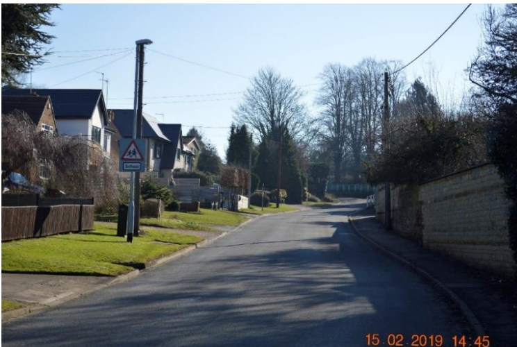
Into the village from the A428