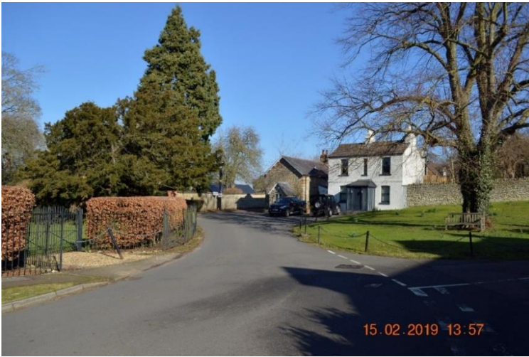
More of The Cross