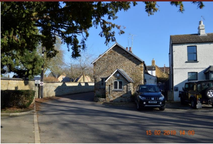
The Old School.