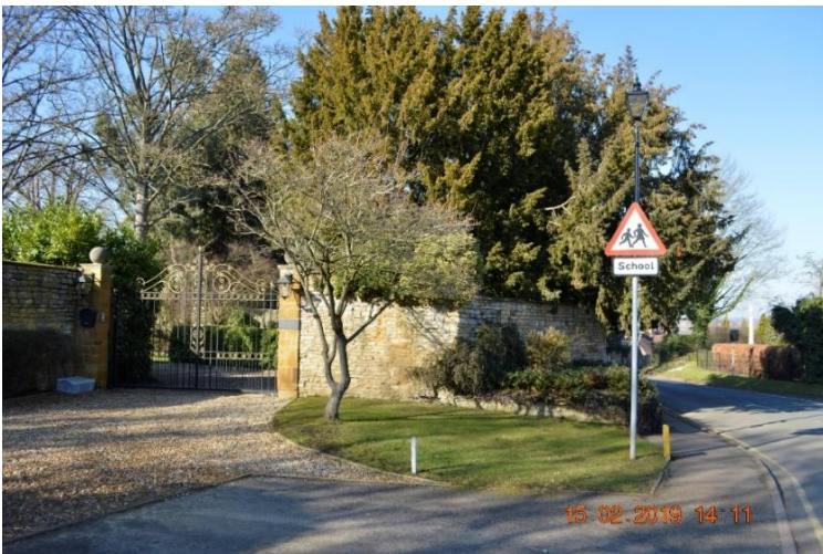
Opposite 'The Cross' War Memorial.